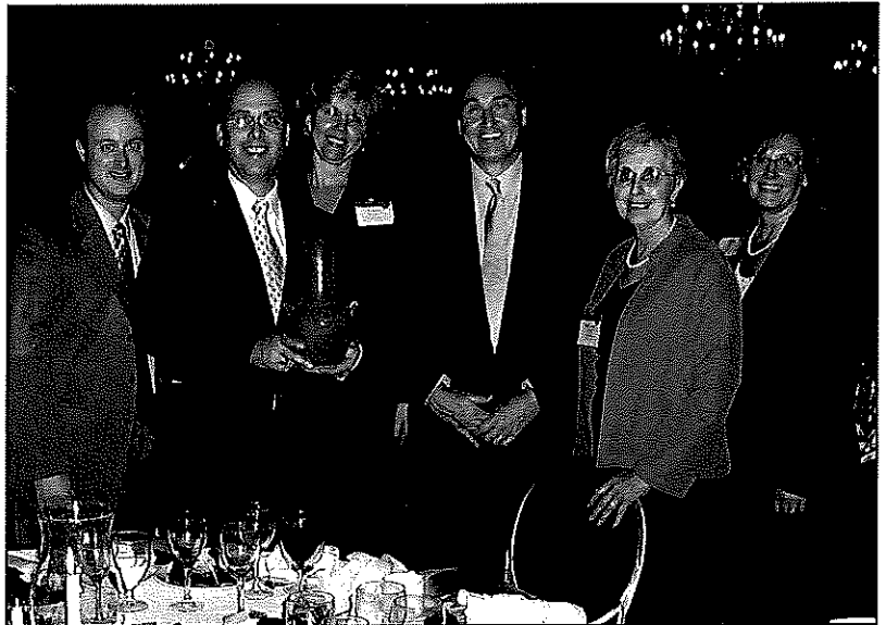
Saint Thomas Hospital receives 'Spirit of Planetree' Award Honoring Dispensary of Hope

Program information, applications, income criteria and inventory can be found at www.stthomas.org under the tab hospital services. Look for Dispensary of Hope.